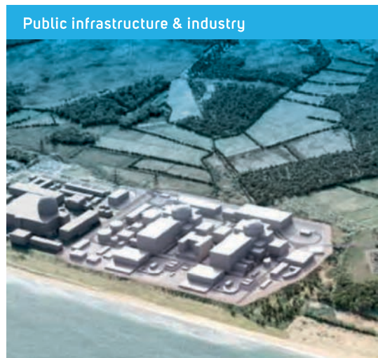
Public infrastructure & industry